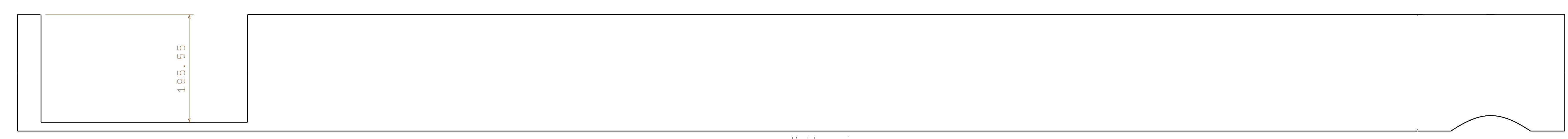
Bottom view Scale: 1:3